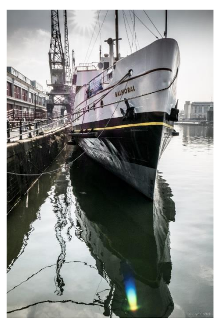
Build a Ship on a Ship – supporting 13 to 15 year olds Volunteer engineers are required for one or more days on October 10th 11th 12th 13th 2017 - MV Balmoral Wapping Wharf / Bristol BS1 4RH

The programme is led by specialist facilitators and we require a team of STEM ambassadors interested in the maritime engineering industries. Volunteers are needed -